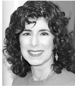
Phoenix Miami, FL