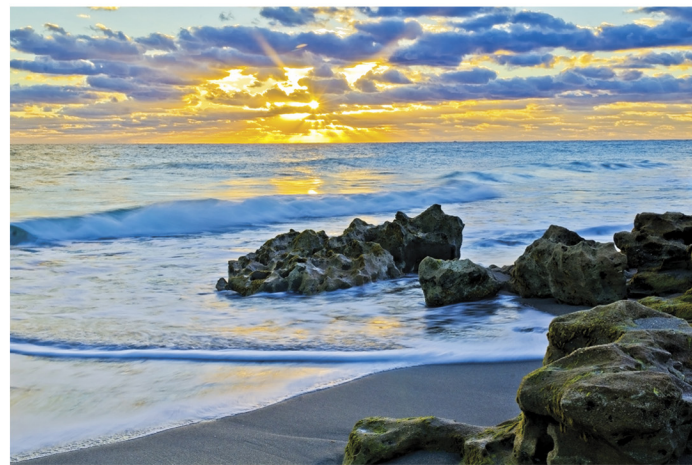
Dawn's Early Light, Photography.

“Photography is a mystical experience. I see the soul of all who grant me the privilege of photographing them.”